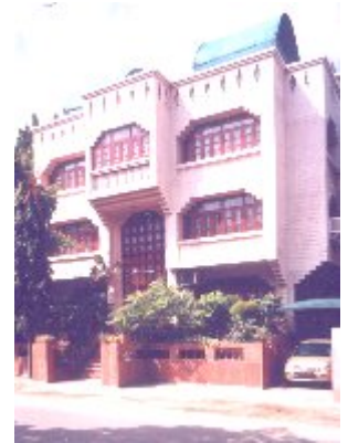
SAI (H.O. Building, Ahmedabad)

As we have entered 2005, let us all first pray for the Tsunami Victims who lost lives, their near & dear ones & property ..... virtually everything. At H.O. Ahmedabad, we all were reminded of the killer earthquake of 2001 and how Gujarat fought against all odds to rehabilitate & reconstruct. As they say life has to go on.